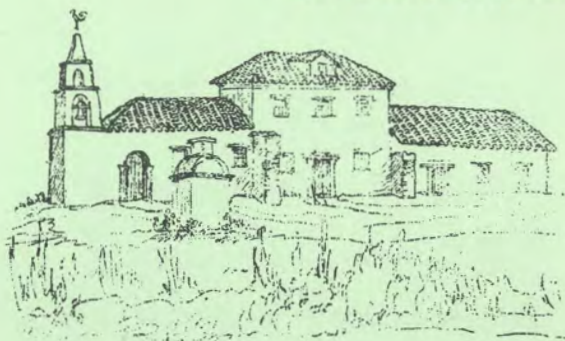
THE CHAPEL OF LAS FLORES 1850: Sketch by H.M.T.Powell