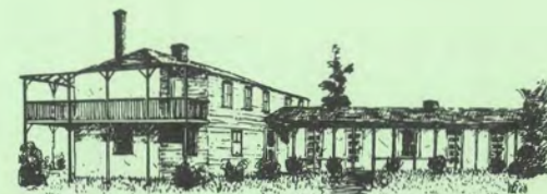
FORSTER ESTANCIA, LAS FLORES Built with Asistencia materials Sketch: "Amigos del Antaño"