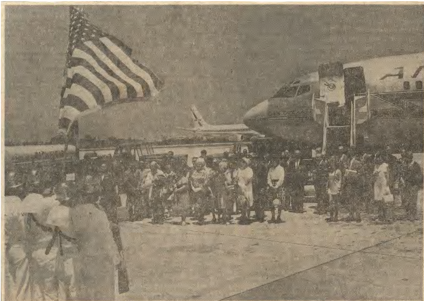
Visitors from Mallorca and San Diegans on hand at Lindbergh Field to greet them stand at attention as Naval Training Center band plays national an-

them of two nations. Mallorca is birthplace of Father Junipero Serra, who founded Mission San Diego de Alcalá on July 16, 1769.